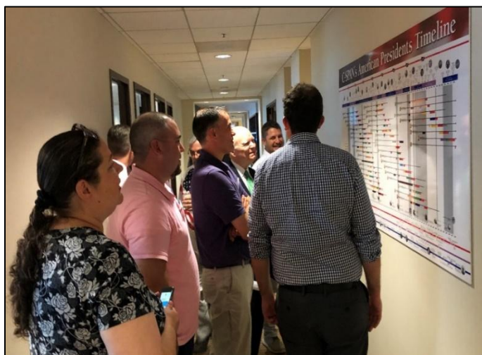
C-SPAN invites teachers to its headquarters to learn how to integrate C-SPAN Classroom's resources into their classrooms.