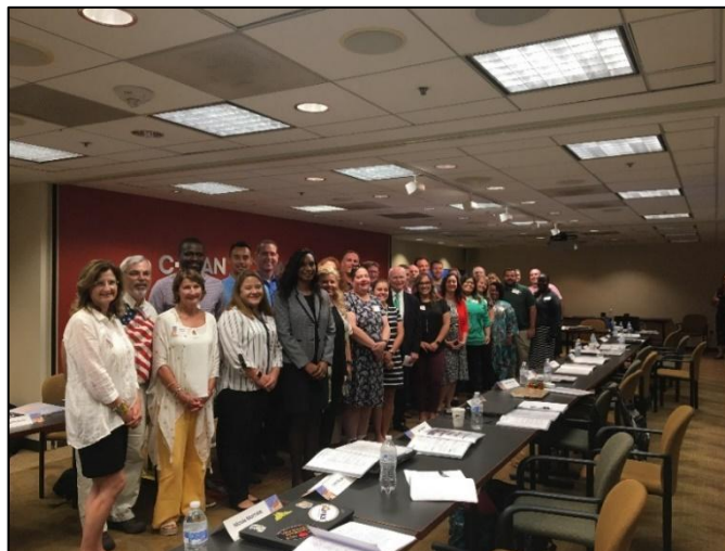
Summer Conference: Teachers from around the country join us in C-SPAN's offices in DC to engage in a workshop session to learn about C-SPAN Classroom's free resources.

Now in its 32 nd year, C-SPAN hosts a summer teacher fellowship program for teachers who are already familiar with our resources and who use them frequently when teaching. Five teachers are selected to work with C-SPAN for four weeks during the summer months to develop and revise new and existing resources for teachers. More information about the program can be found at C-SPAN Classroom .