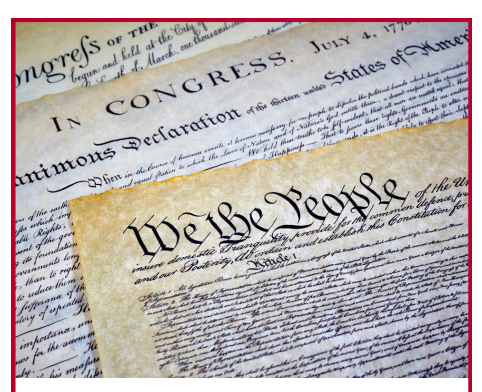
Create fellowships to encourage scholarly research in undertold stories, bringing together researchers and special collections