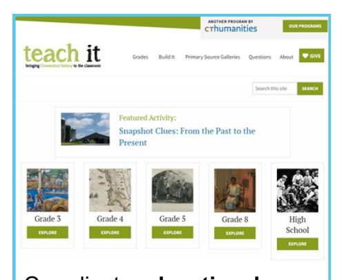
Coordinate educational resources and provide support for teachers and educators in line with new social studies standards