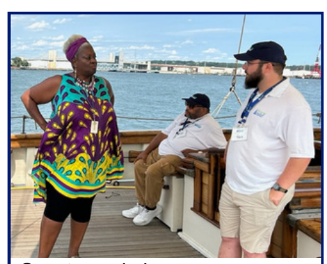
Create and share program, evaluation, and accessibility tools to local committees to guide programming from the grassroots level