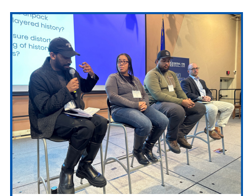
Host an annual conference for people interested in the 250th, connecting the commission's themes with projects around the state