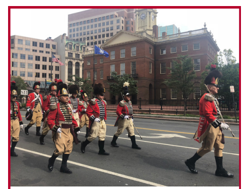
Manage a calendar and website to raise awareness, build excitement, encourage tourism, and inspire civic participation in 250th activities