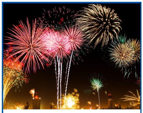
Host signature events in 2026 that will attract millions of residents and tourists via partnerships with organizations like Hartford Bonanza